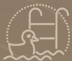
Kids Friendly Organic Pool