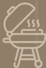
Bar B Q Area