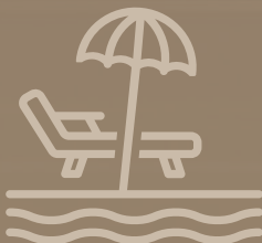
Pool Side Baja Shelves