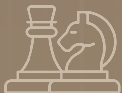
Board Games Corner