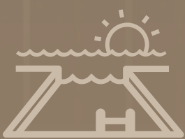
Roof Top Infinity Pool