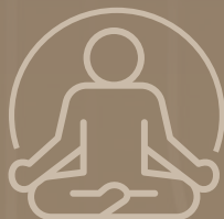
Floating Meditation Deck